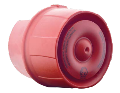
ML-2470.IS Maxlogic Conventional Sounder, Weatherproof (IP65), Intrinsically Safe

Specially designed for high-risk areas where ATEX certification is required, and precise and stable detection performance is crucial. The ML-24X0.IS series sounders/beacons/sounder-beacons are easy to install and use, with an ergonomic design. These products can be used across various systems, from intelligent addressable fire alarm systems to conventional fire alarm systems.