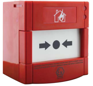
ML-2710.IS Maxlogic Conventional Manual Call Point, Resettable, Intrinsically Safe

Specially designed for high-risk areas where ATEX certification is required, with an emphasis on precise and stable detection performance. The ML-27X0.IS series call points, featuring easy installation and user-friendly, ergonomic design, are preferred for their compatibility with all conventional fire alarm systems.