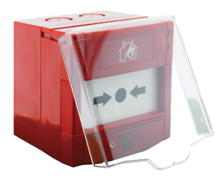
ML-2730.IS Maxlogic Conventional Manual Call Point, Resettable, Weatherproof (IP65), Intrinsically Safe