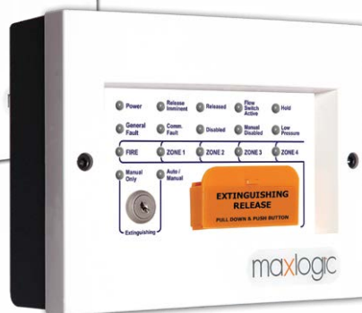
ML-3313 Maxlogic Konvansiyonel Söndürme Durum Gösterge Ünitesi