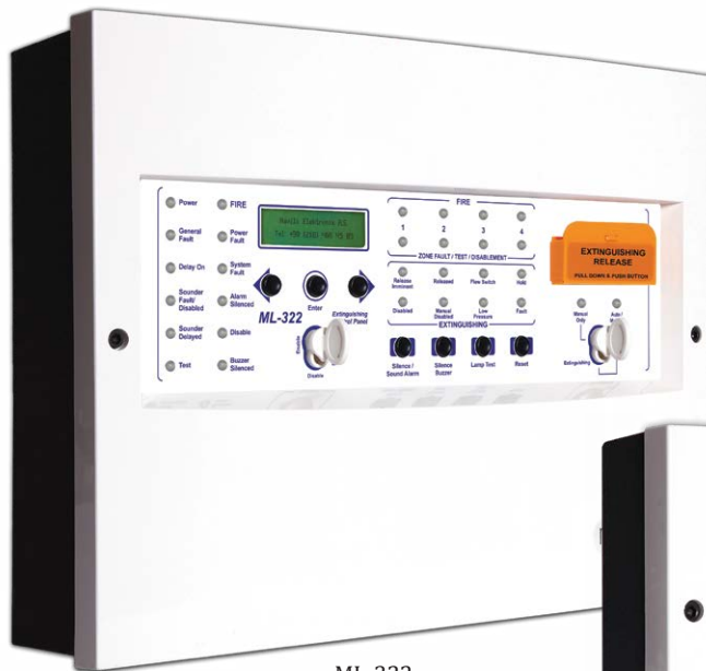
ML-322 Maxlogic Konvansiyonel Yangın Söndürme Santrali, 4 Algılama Bölgesi, 1 Söndürme Çıkışı

Conventional series fire extinguishing control panel operates on cross-zone principle, has 4 detection zones and one extinguishing release output which is programmable according to the zone requirements. Conventional extinguishing control panel is microprocessor controlled, offers high performance and can easily be integrated into all extinguishing projects.